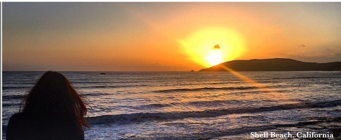
Shell Beach, California

Noel Laboratories, Inc. 7623 Morro Rd. Atascadero, CA Tel: (805) 461-6634